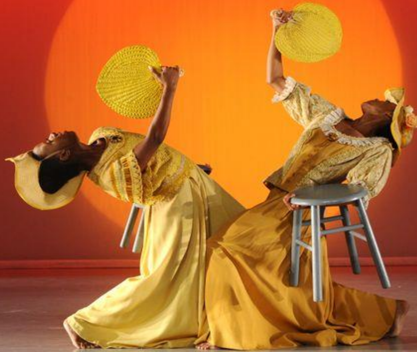
Ailey II in Alvin Ailey's Revelations.