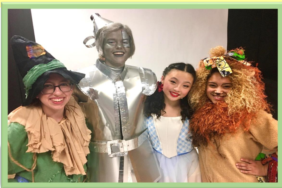
All PC Academy of Dance Arts