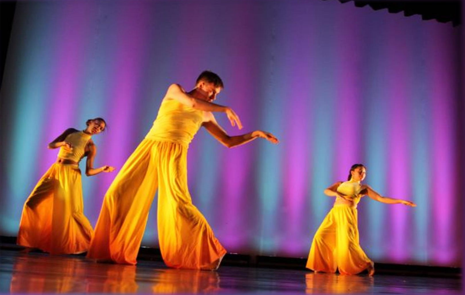
PC Whitney M. Young Magnet HS

Congratulations to Our Brave NHSDA Graduates! Your Leadership, Personal Growth, and Community Service Will Forever Make a Positive Impact On Our World! Continue Your Dream Dancing in Your Next Great Adventure!