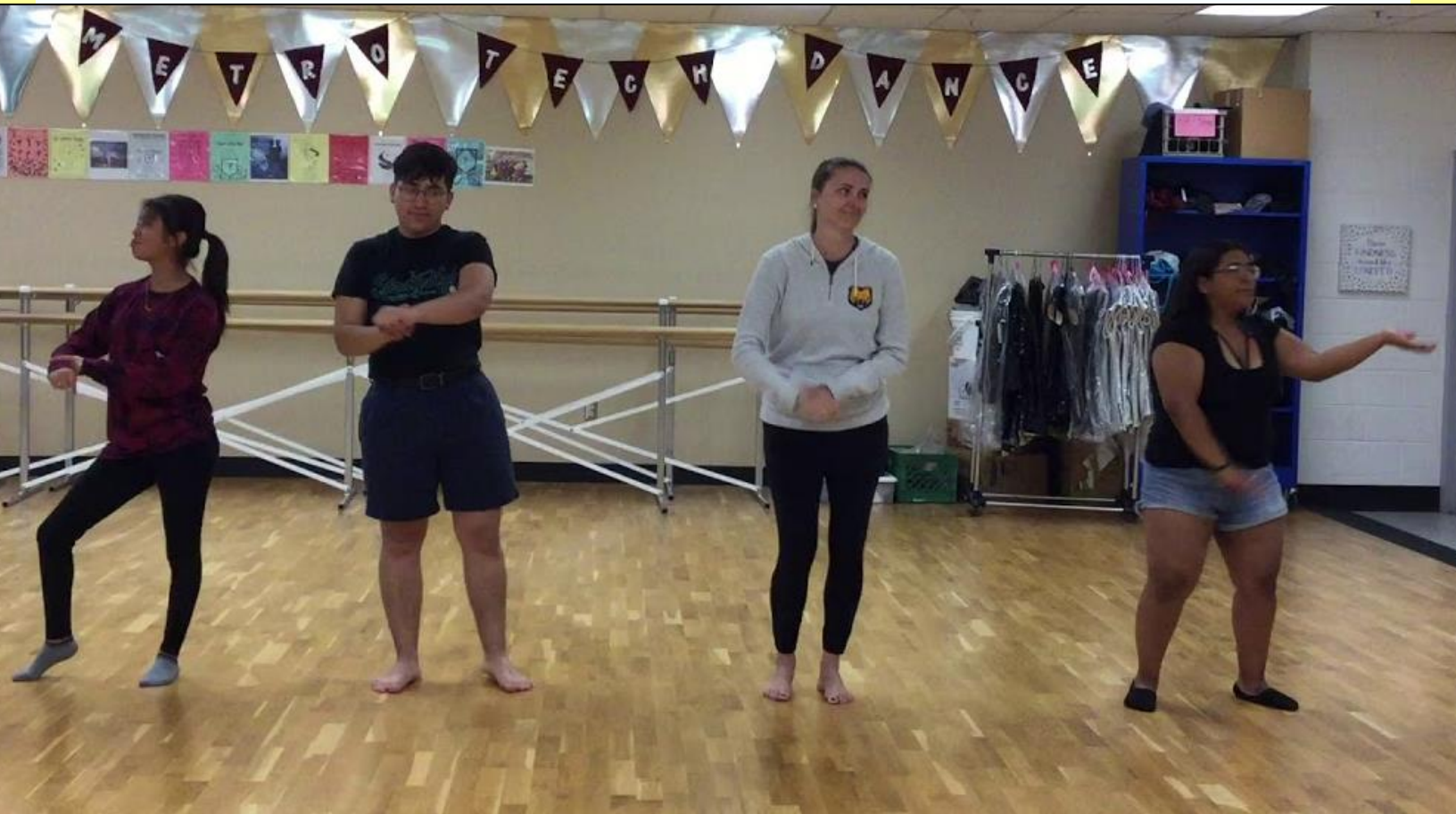
Student dancers demonstrate the "Flash Mob." PC Metro Tech HS