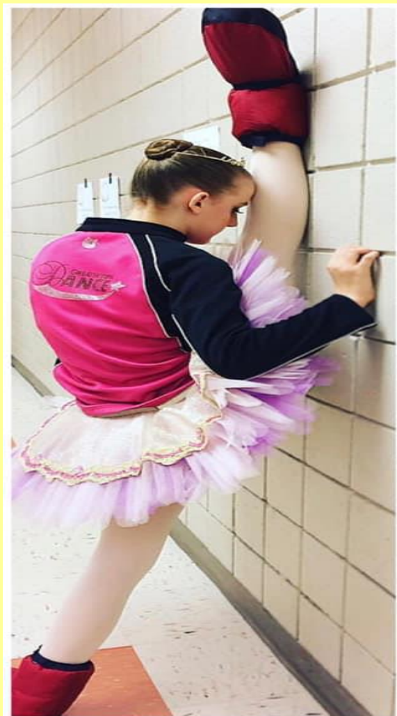
All PC Greater York Dance