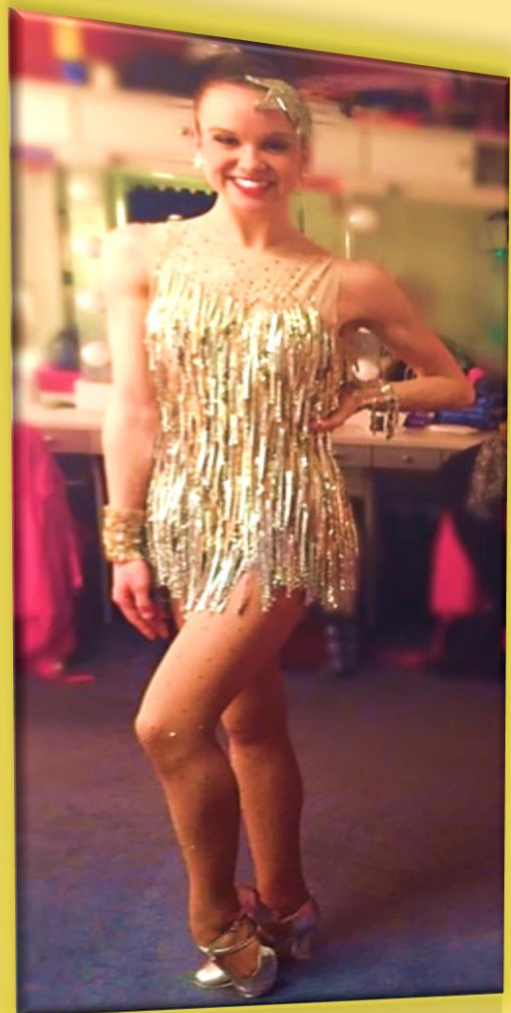
PC Radio City Rockettes