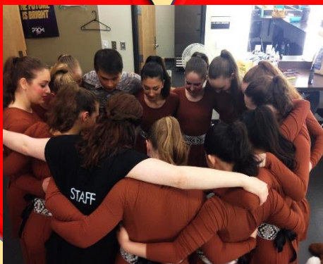
PC All That Dance

Fun is had by all with games, performances, master classes, and prizes!