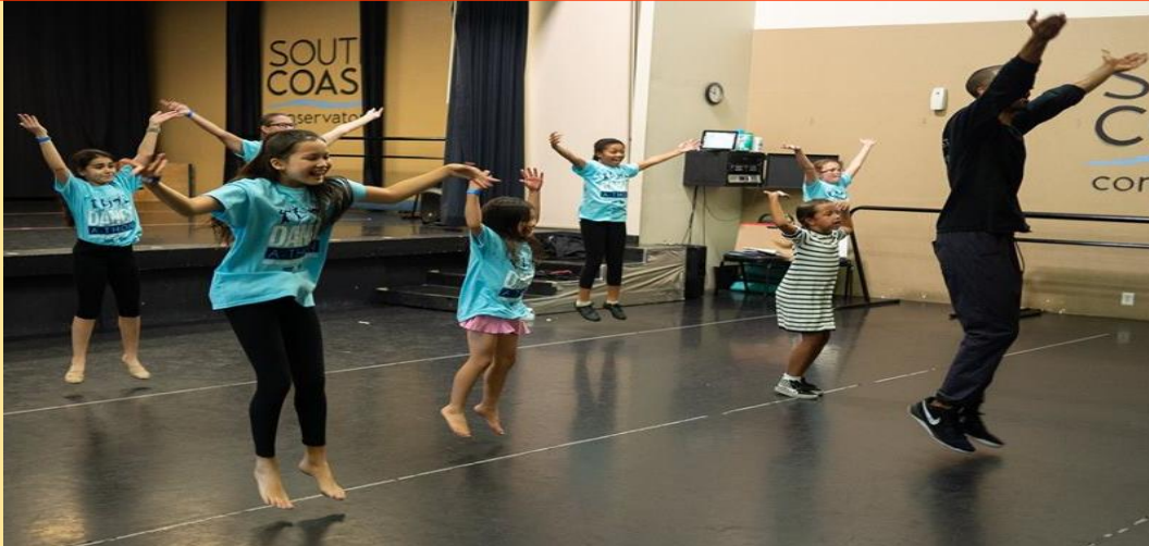
PC South Coast Conservatory