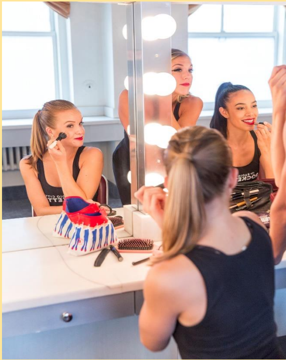
All PC Radio City Rockettes

I am always impressed at how quick all the Rockettes are to help one another and engage in giving back to our community. This season, knowing how important finding a cure for ALS (amyotrophic lateral sclerosis) is to me, my Rockette sisters surprised me with a birthday donation to a charity dedicated to a cure. My heart bursts for these women and I cannot even begin to express how thankful I am to have gained this family.