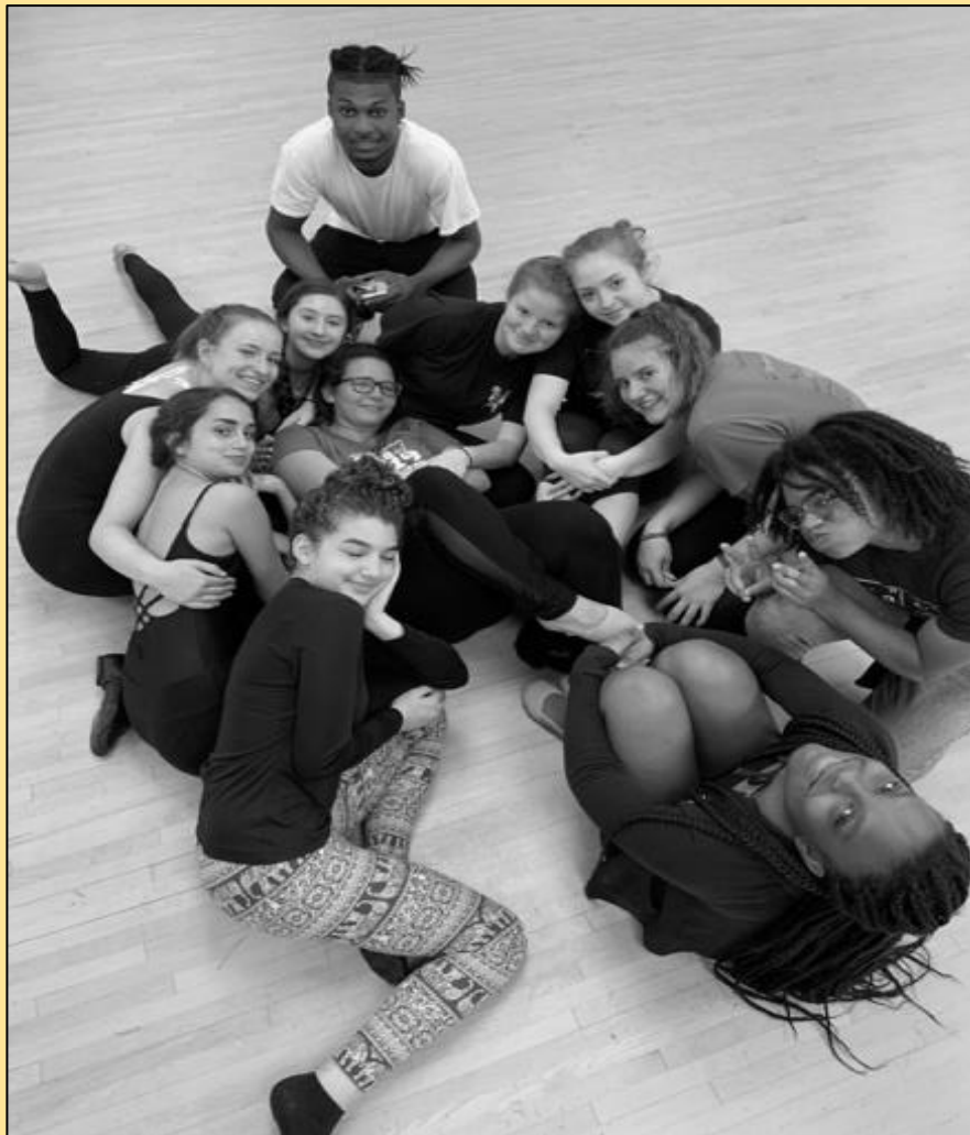
FPC Dance Company pre-performance hugs and well-wishes!