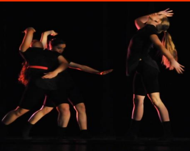
All PC Youth Performing Arts School