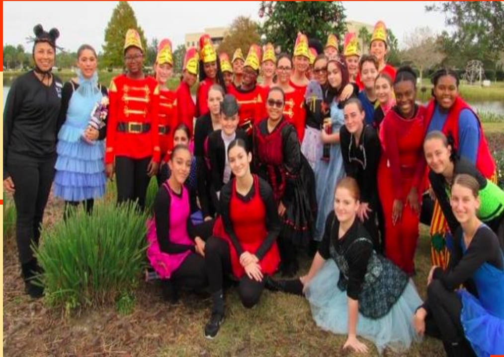
All PC Flagler Palm Coast High School

We began with a pep-rally performance tailored to the homecoming Pirate theme so that our production entitled “ Castaway ” would complement our shipwreck idea. This was the perfect opportunity for first-year dancers, upperclassmen, and studio competitors to collaborate on creating a beautiful piece while fueling school spirit.