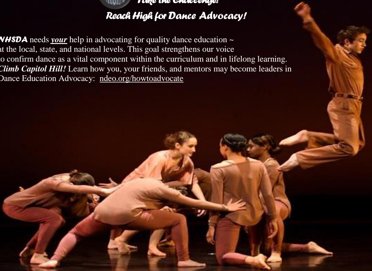
PC Youth Performing Arts School

NHSDA needs your help in advocating for quality dance education ~ at the local, state, and national levels. This goal strengthens our voice to confirm dance as a vital component within the curriculum and in lifelong learning. Climb Capitol Hill! Learn how you, your friends, and mentors may become leaders in Dance Education Advocacy: ndeo.org/howtoadvocate