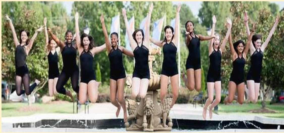
PC Dance Theatre South

ensemble training for students to build strong technique, teaching skills, and leadership within a positive environment. They perform to raise funds for charitable causes and, by means of their "buddy" system they give other students constructive feedback and write good luck notes before programs.