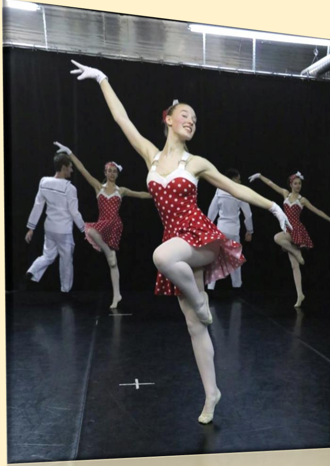
PC Dance Conservatory of Maryland

Dance Conservatory of Maryland Teachers & Staff