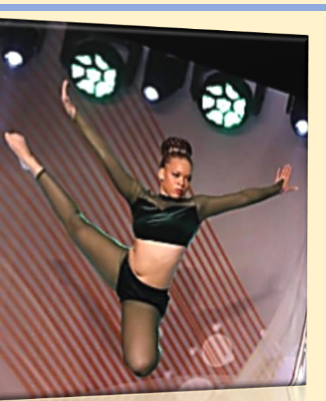
PC American Dance Academy