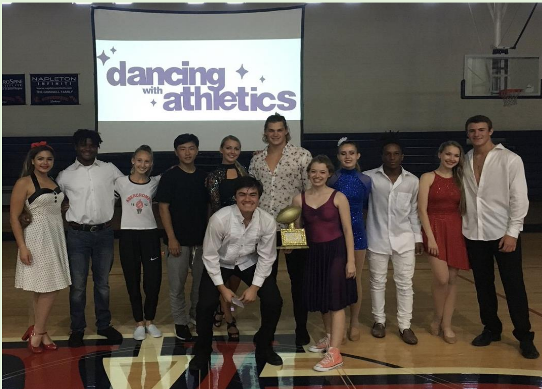
Windemere Preparatory School

T he Windemere Preparatory School Announced "Our first ever NHSDA sponsored Dancing With Athletics Night raised over $2000 for Kids Beating Cancer! So proud of our athletes and dancers!" ~ Congratulations!