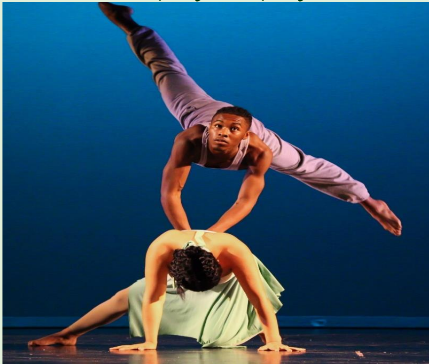
California Dance Education Association