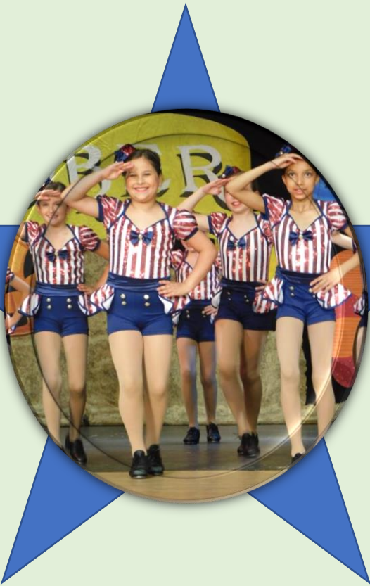
PC Pembroke School of Performing Arts