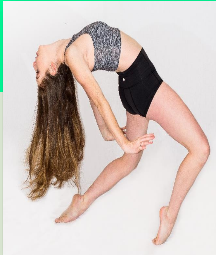
PC Dance Unlimited

While composing I struggled without the artist singing, and, instead, just speaking. I had never choreographed to spoken words which was a challenge, but it helped me explore unique ways to move as well as making the moves literal in their meaning.