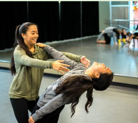
PC The Fine Arts Center