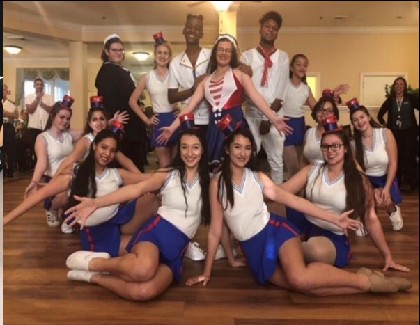
Brookdale Senior Living Center, Palm Coast, FL