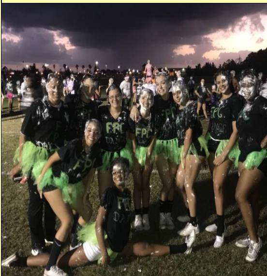
Insanity Games, Homecoming, 2018