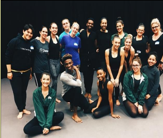
Arts Immersion Day, Hillsborough Community College, Ybor