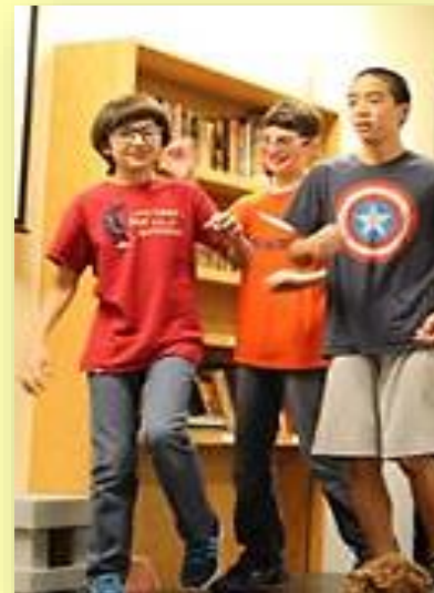
Students dance in class.