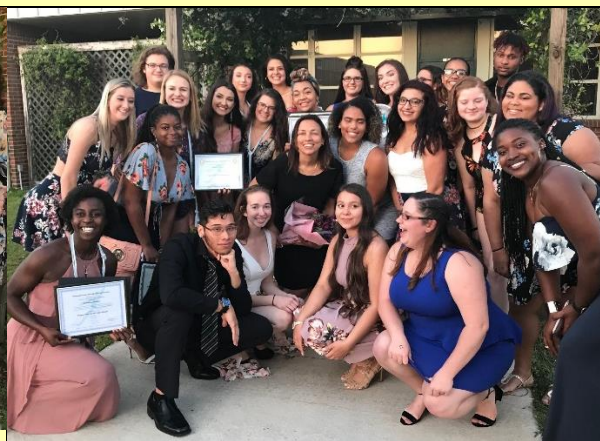
FPC Dance Banquet and Awards 2018