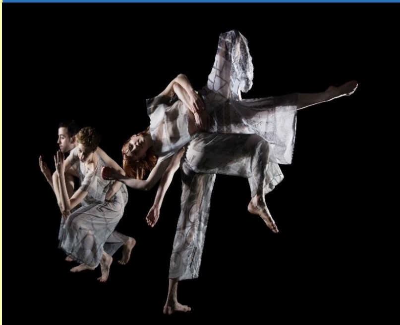
Set and Reset. Choreographer: Trisha Brown.