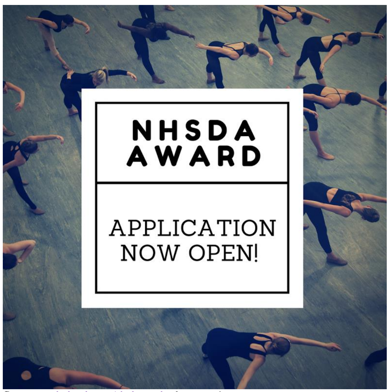
Go to www.nhsda-ndeo.org/nhsdaaward to learn more!