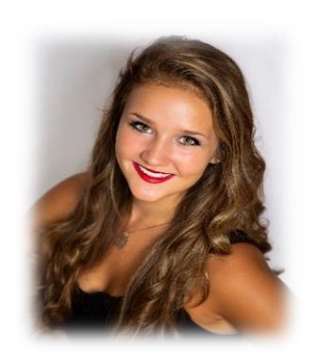
Tap ~ Purely for Love and Joy