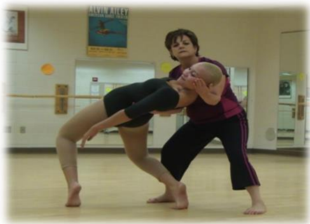
Master Dance Classes!