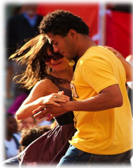
Merengue

My family is the reason why I love to dance ~ Mi familia es la razon porque me encanta bailar!