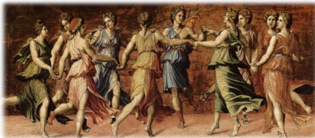
"Apollo and the Muses" by Baldassar